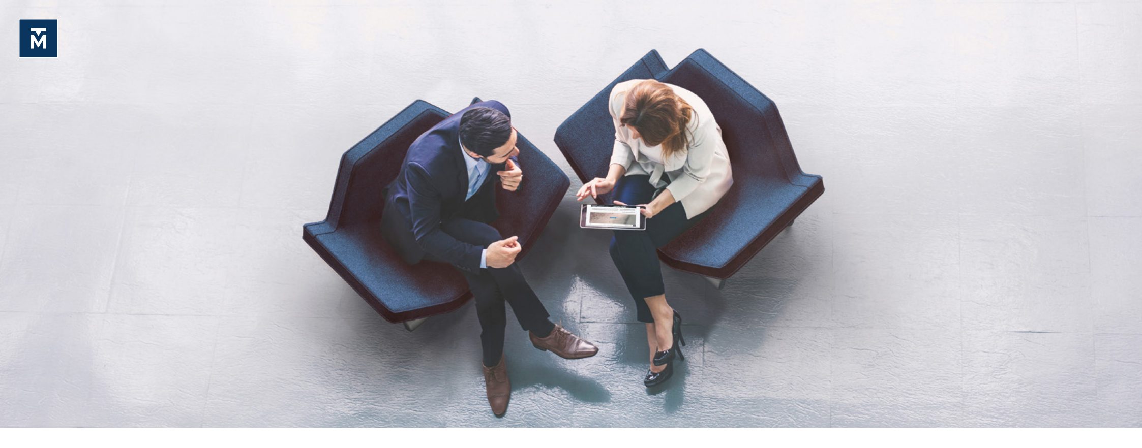
Fit For Free works with Top of Minds to fill this vacancy. Contact Hayke Tjemmes for more information.